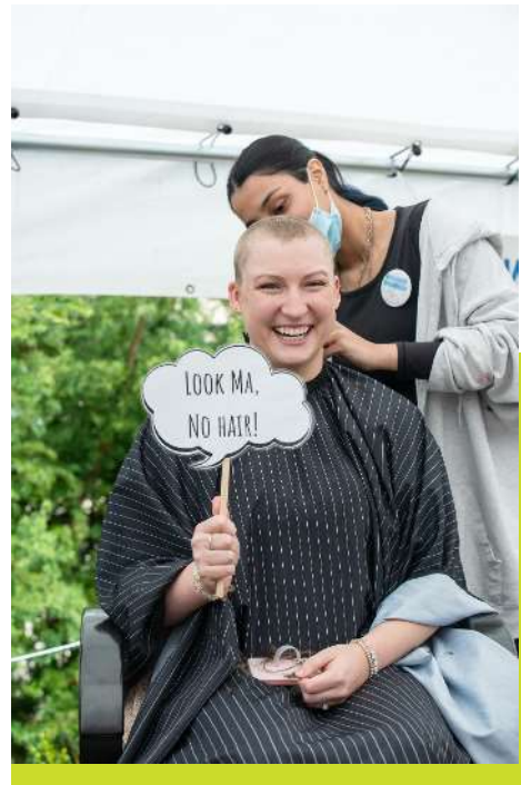
JOYFUL AND GENEROUS MOMENTS AT THE 2022 BALDING FOR DOLLARS MAIN EVENT.